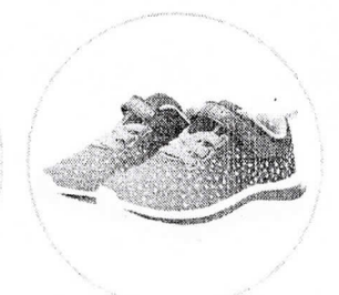
Sneakers to Wear Every Day